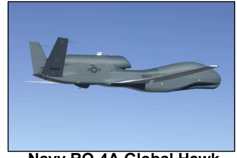
Navy RQ-4A Global Hawk