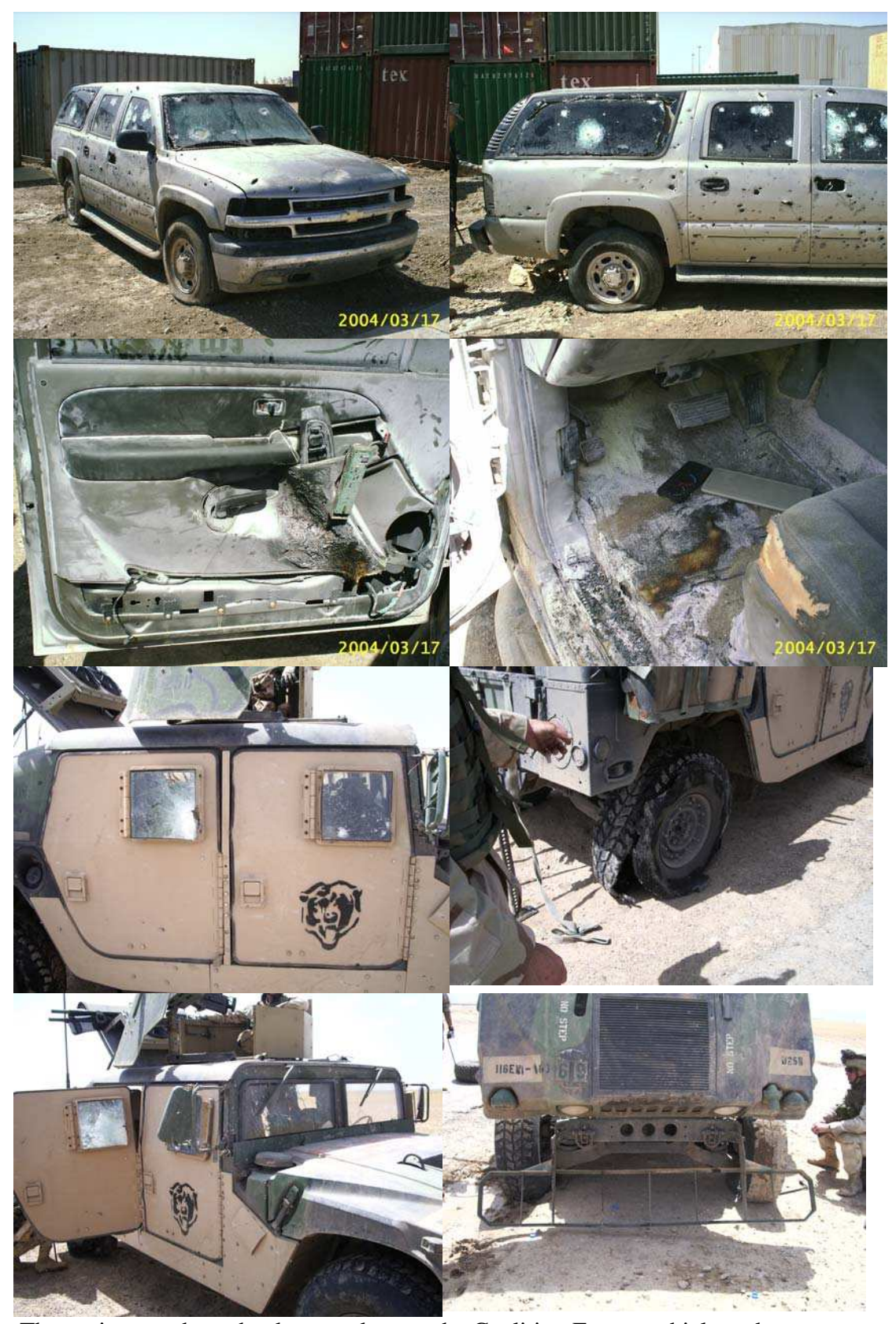
These pictures show the damage done to the Coalition Forces vehicle and prove that the attack actually occurred.