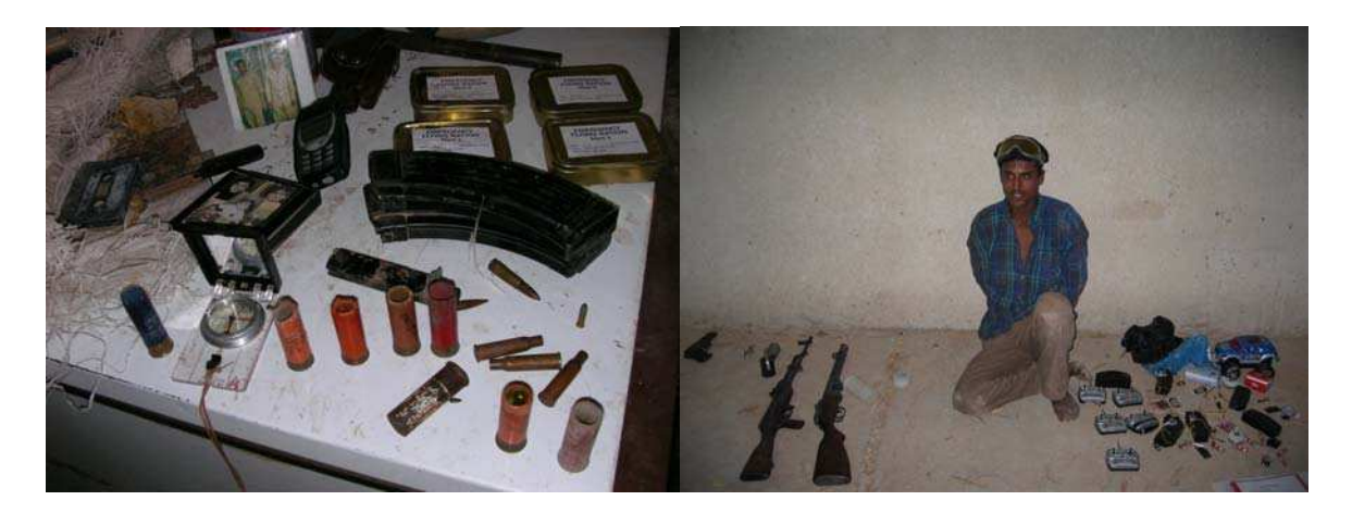
Shows how the items were found in house. Depicts the detainee with weapons.