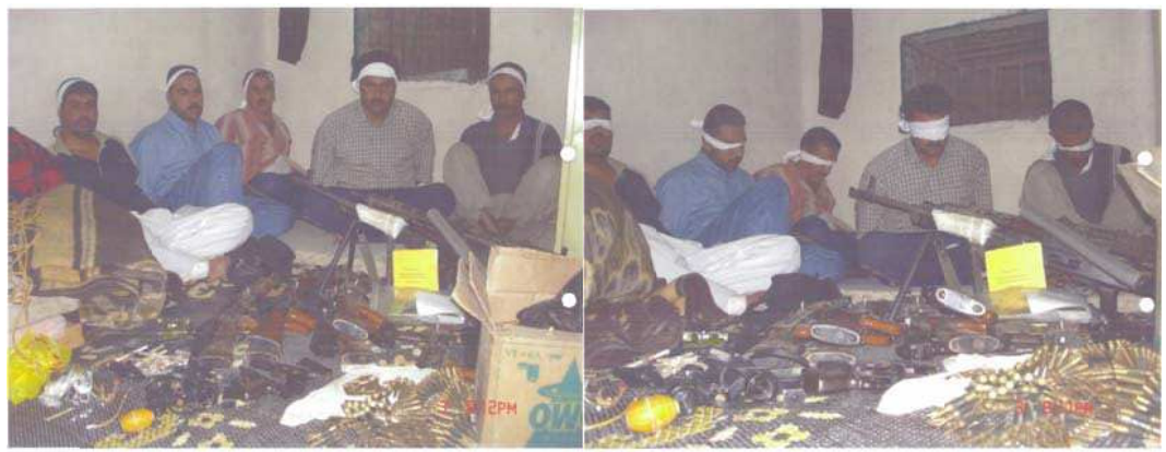
Can see faces.