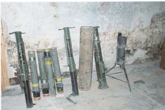
Both pictures show how the weapons were found, but would be better if the detainee was also in the picture.