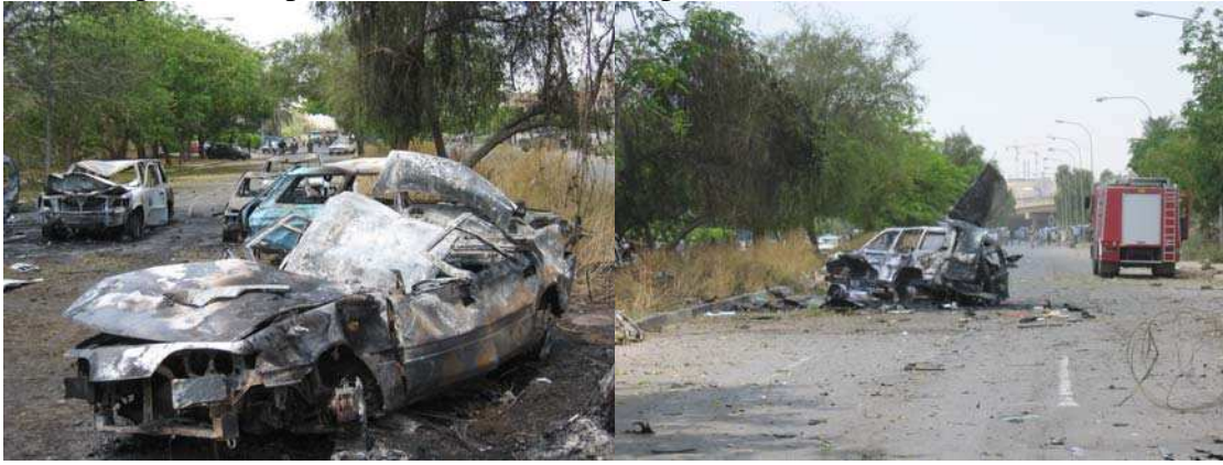
Shows the VBIED.