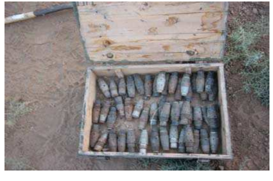
Can see inside the crate.