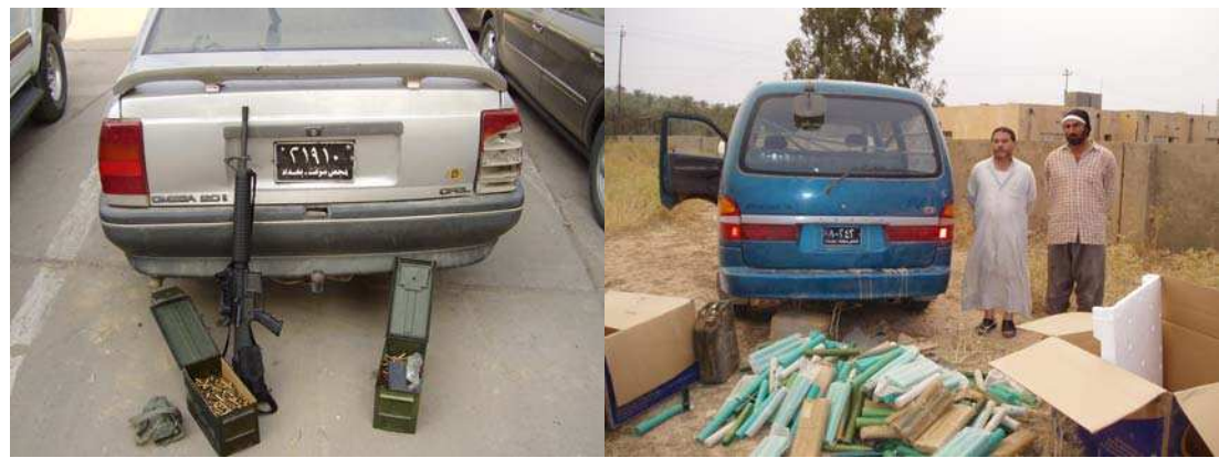
Shows license plate.