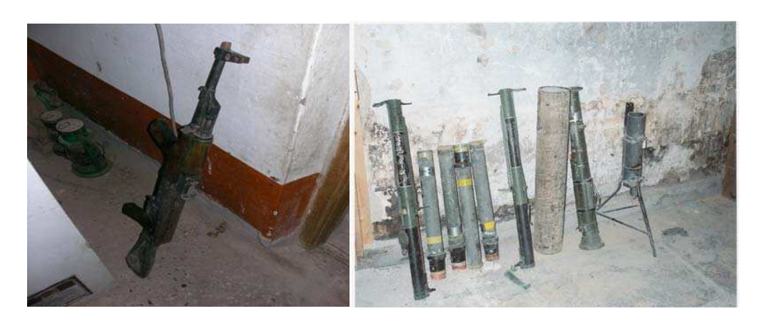
These two pictures show where the weapons were found in the home.