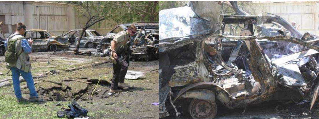
Shows where the explosion occurred.