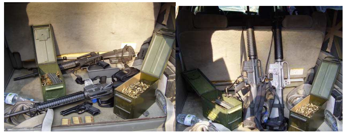
These two photographs show what is contained in the boxes.