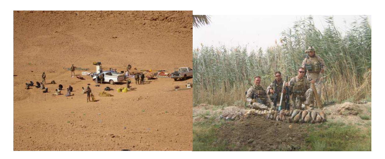
Take a photo of the objective.