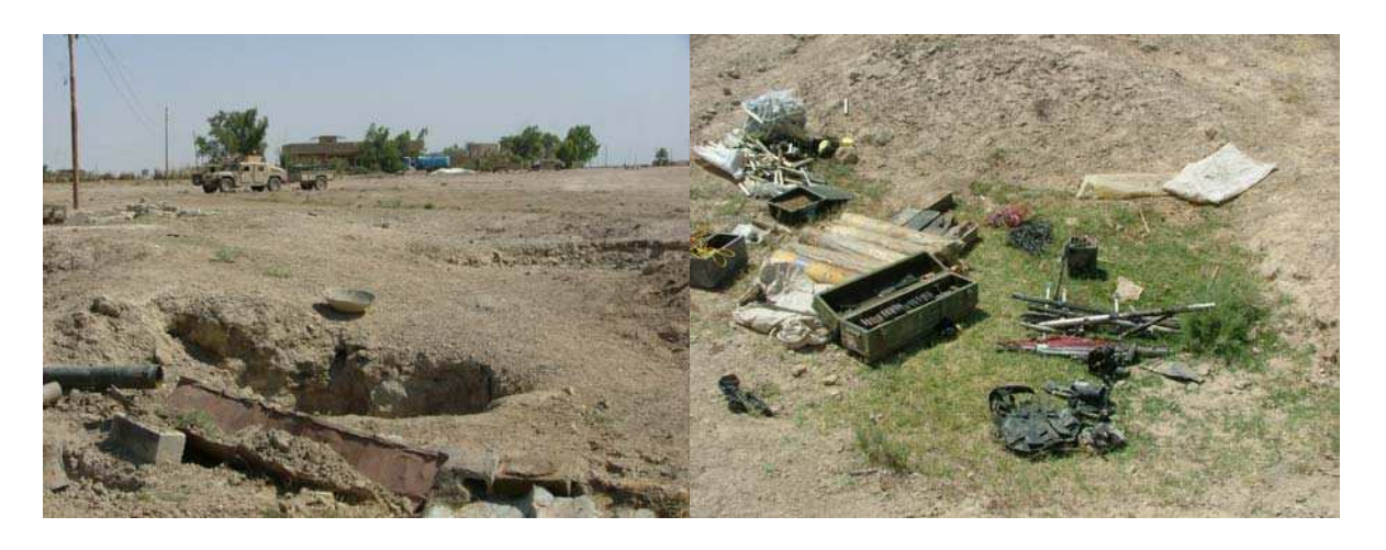
Shows house in relation to cache.