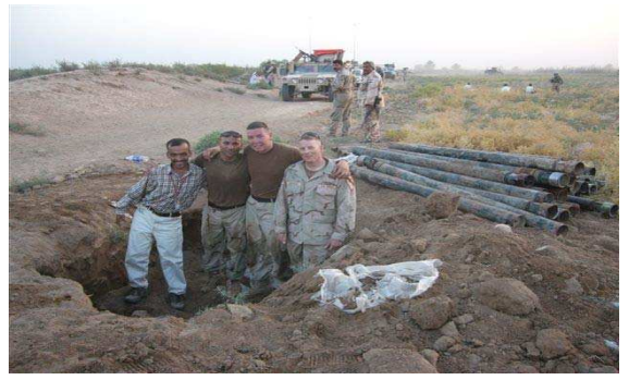
Make the photograph look professional.