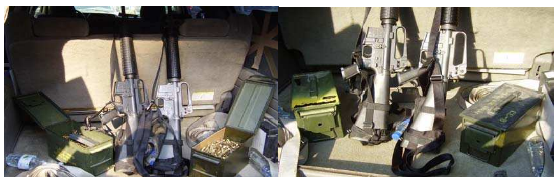
Can see inside the ammo boxes.