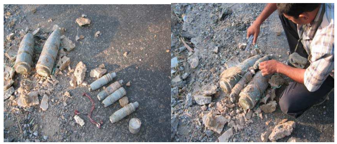
Shows the IED.