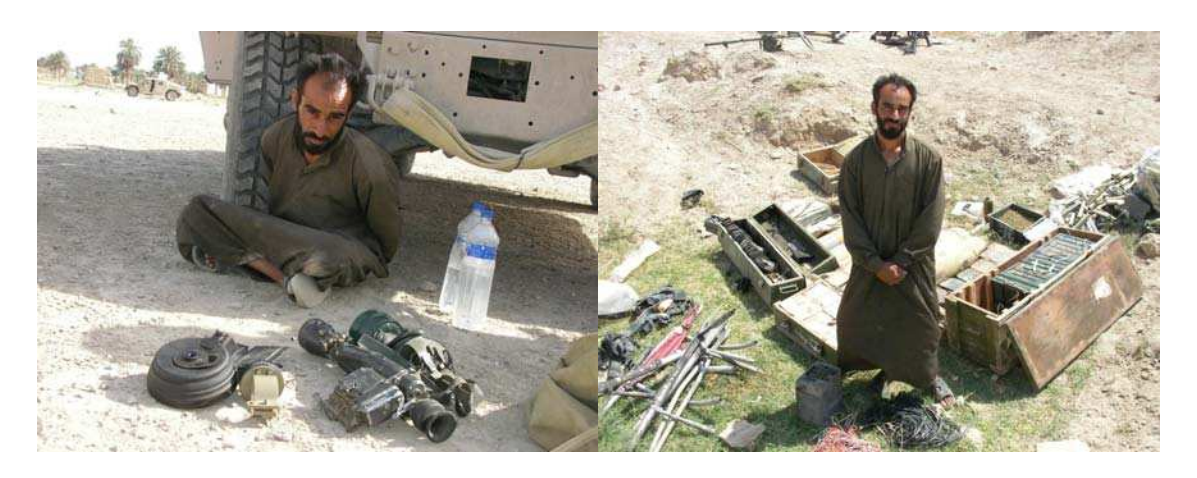
Detainee pictured with contraband.