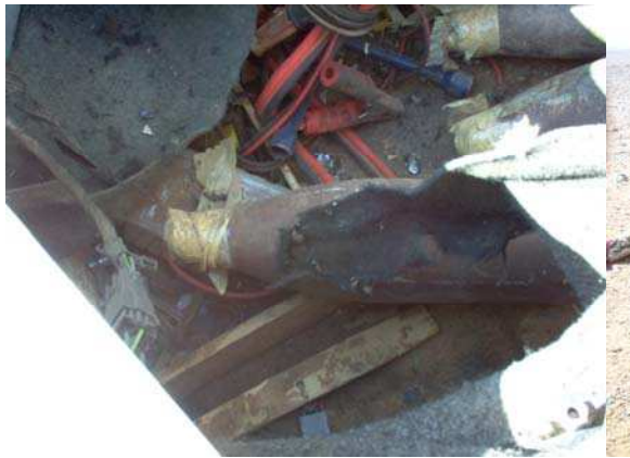
A close up of the explosives.