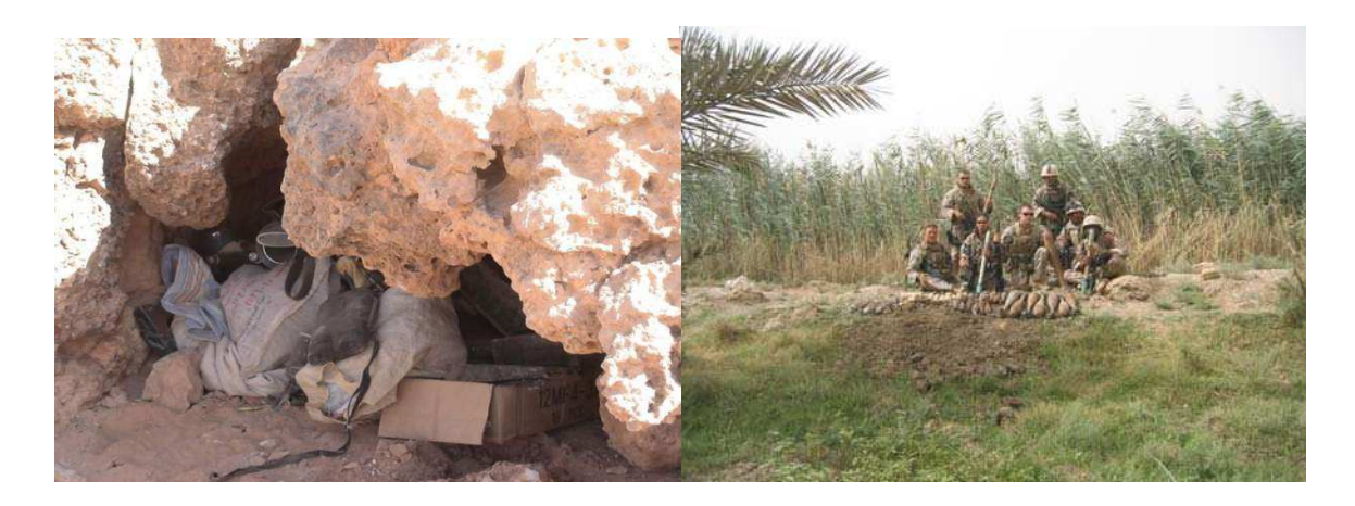
Take photo of how the stuff was found.