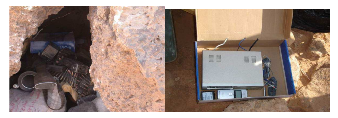
Shows how it was found.