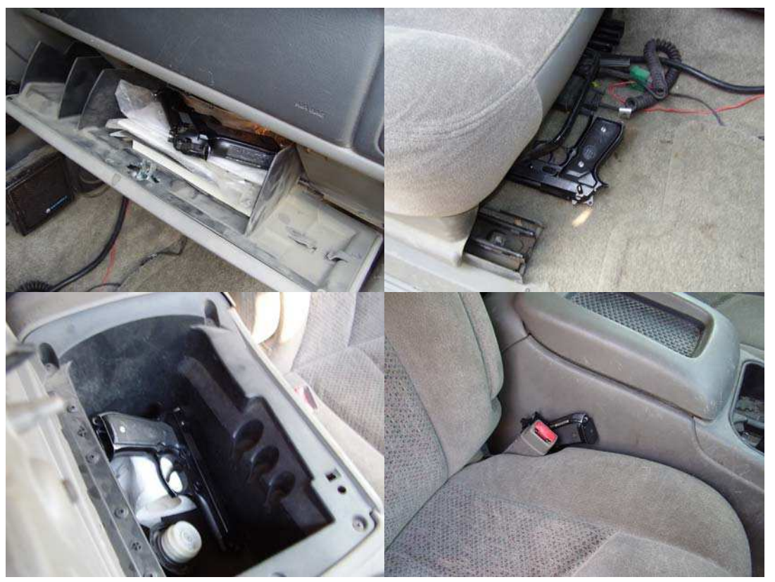
These four pictures show were the concealed weapon was found hidden in the vehicle.