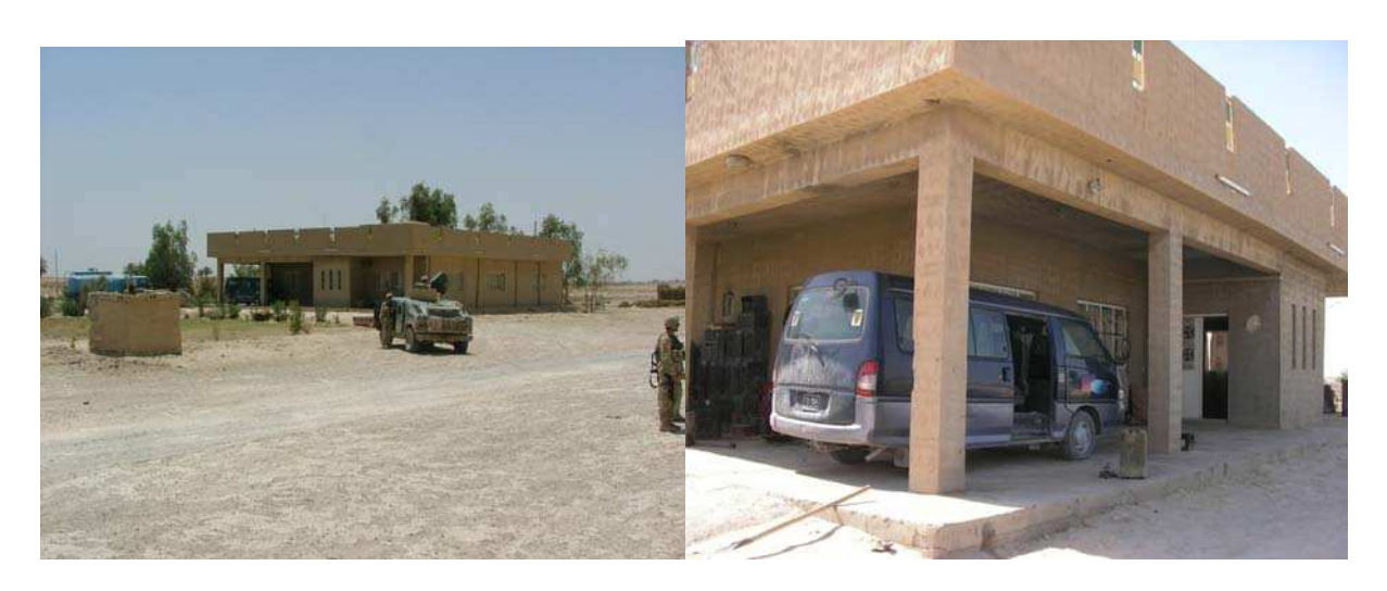
These two pictures show the detainees' residence and show where the raid occurred.