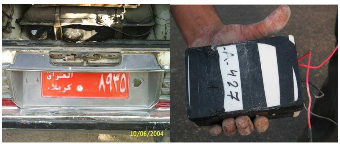
Shows the license plates.