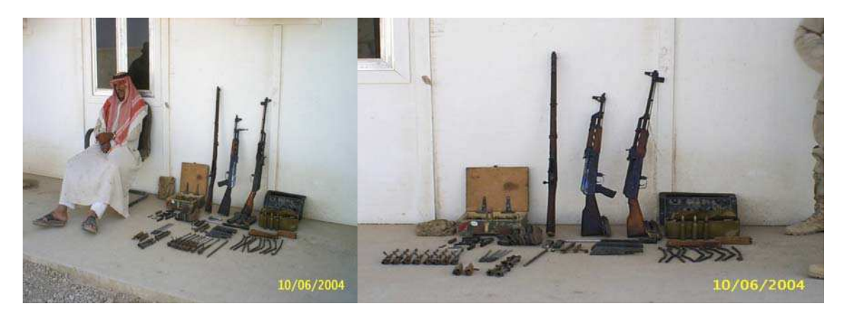
Depicts the detainee with the weapons (a must!).