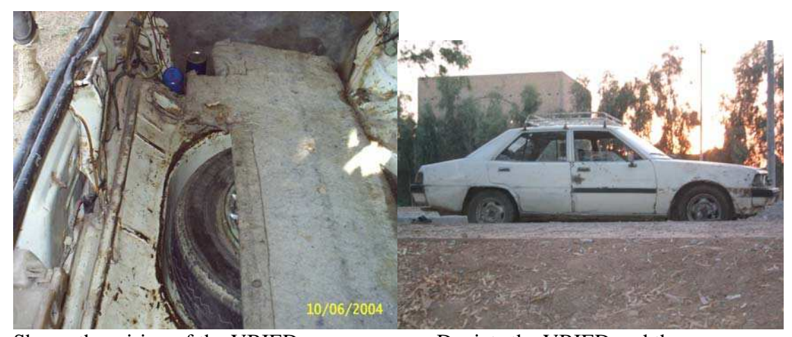
Shows the wiring of the VBIED.