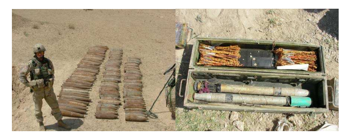
Depicts all of the ordinance found.