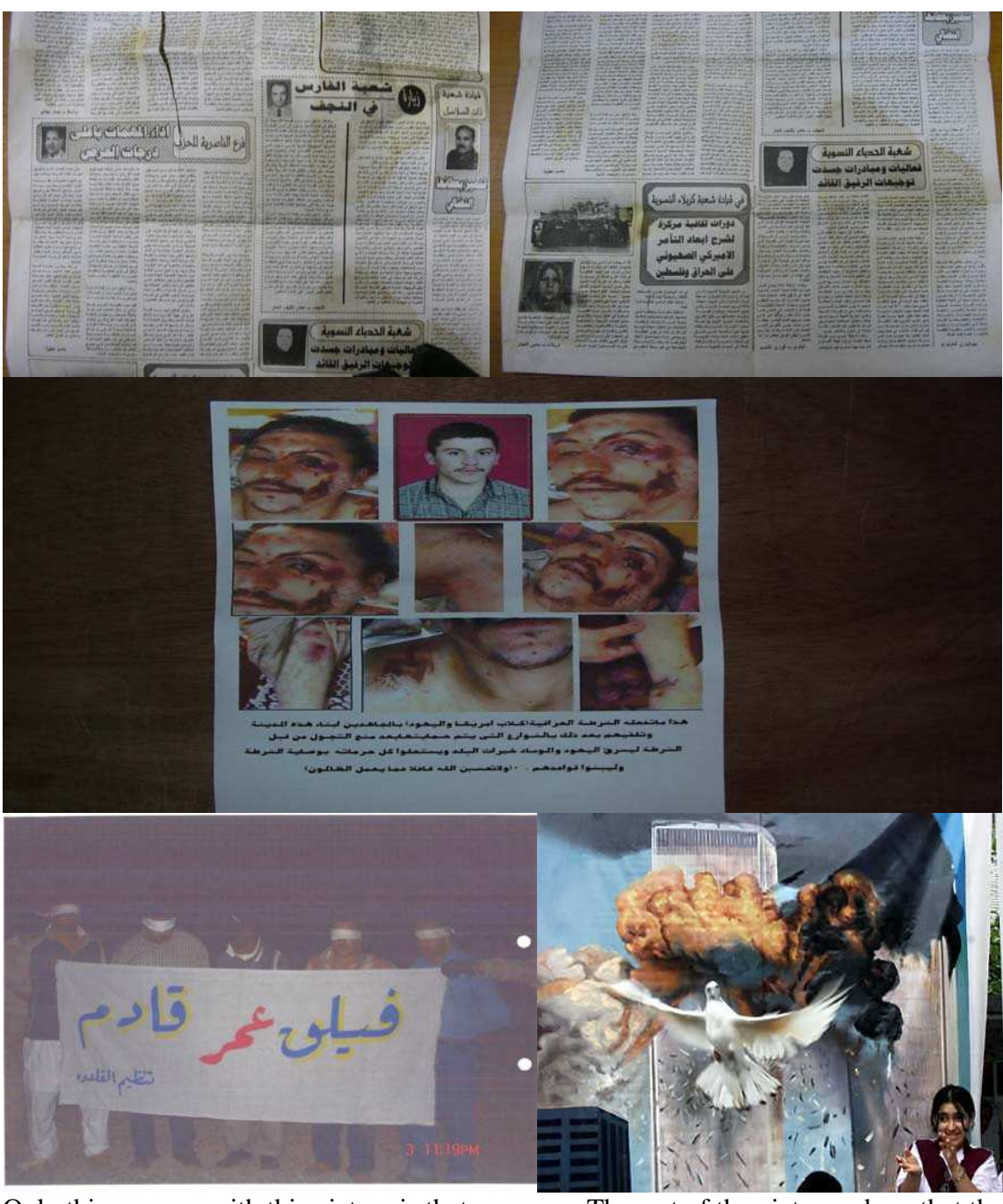
Only thing wrong with this picture is that one can not see the detainees' faces.