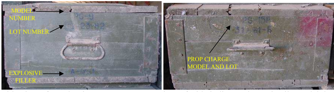
Side view of a Bulgarian PG-15V outer pack. Left side indicates the projectile model, lot number, and type of explosive filler. Right side indicates the propelling charge model and lot.

Pictured above is a typical outer pack for the Bulgarian PG-15V. The box design will remain the same but there will be slight variations in color and markings. The 73MM Rocket Grenade is actually a 'cartridge' and should not be confused with the "RPG" type munitions. The 73MM cartridge comes in both a HEAT and a HE version and is fired from a smooth bore 73MM gun either mounted on a BMP vehicle or a more portable gun with tripod mount.