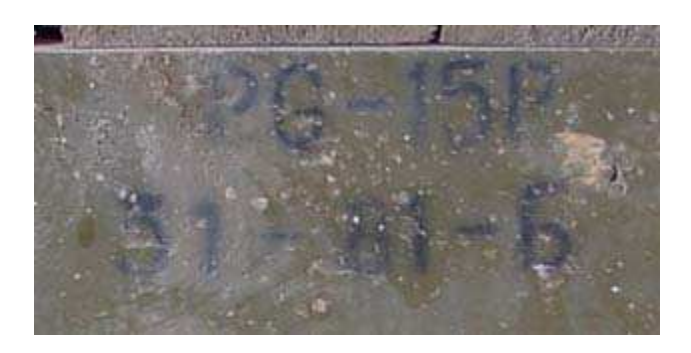
Right side: PG-15P is the standard prop charge found with all 73MM cartridges. The lot number 31-81-B is typical Bulgarian (B indicates country the prop charge was produced – Bulgaria)