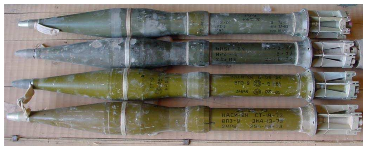
Top to bottom; Czech PG-15V, Polish PG-15W, Bulgarian PG-15V, and Russian PG-9.

6. Paint Color. As with the paint scheme of the boxes, the color of the round can often be an indicator or country of origin. The color differences are markedly different when compared side by side but these differences can be noted and used as an aid.