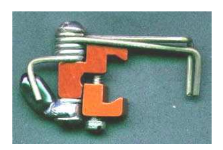
Close-up of device