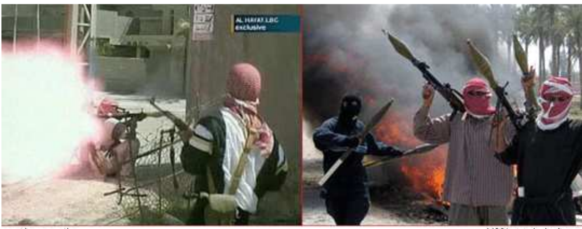
NGIC-88406 FULL IMAGE