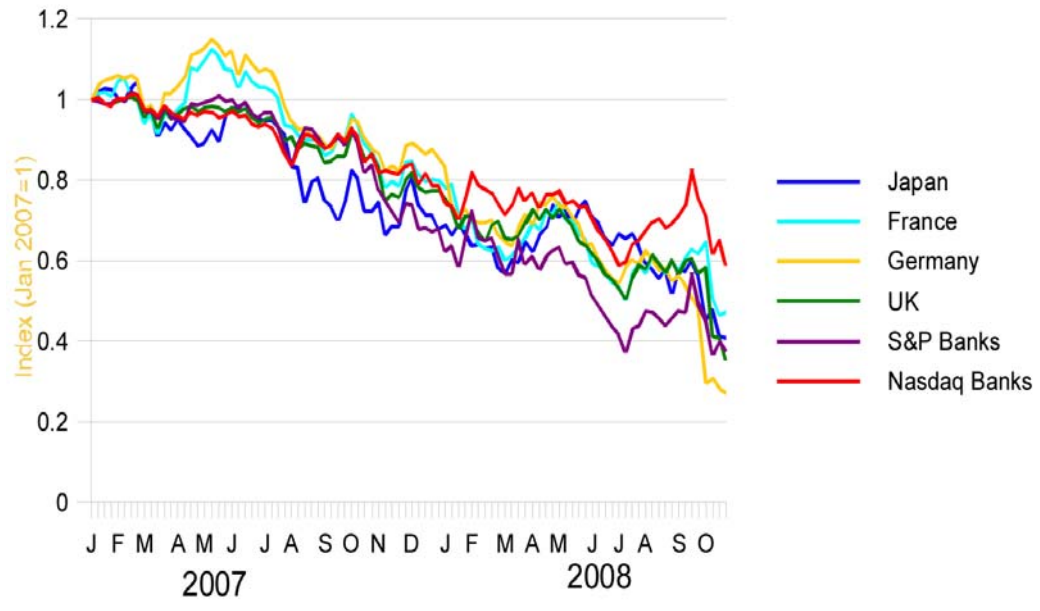
Figure 2. Developed Country Bank Stock Indices, Jan. 2007-Oct. 2008