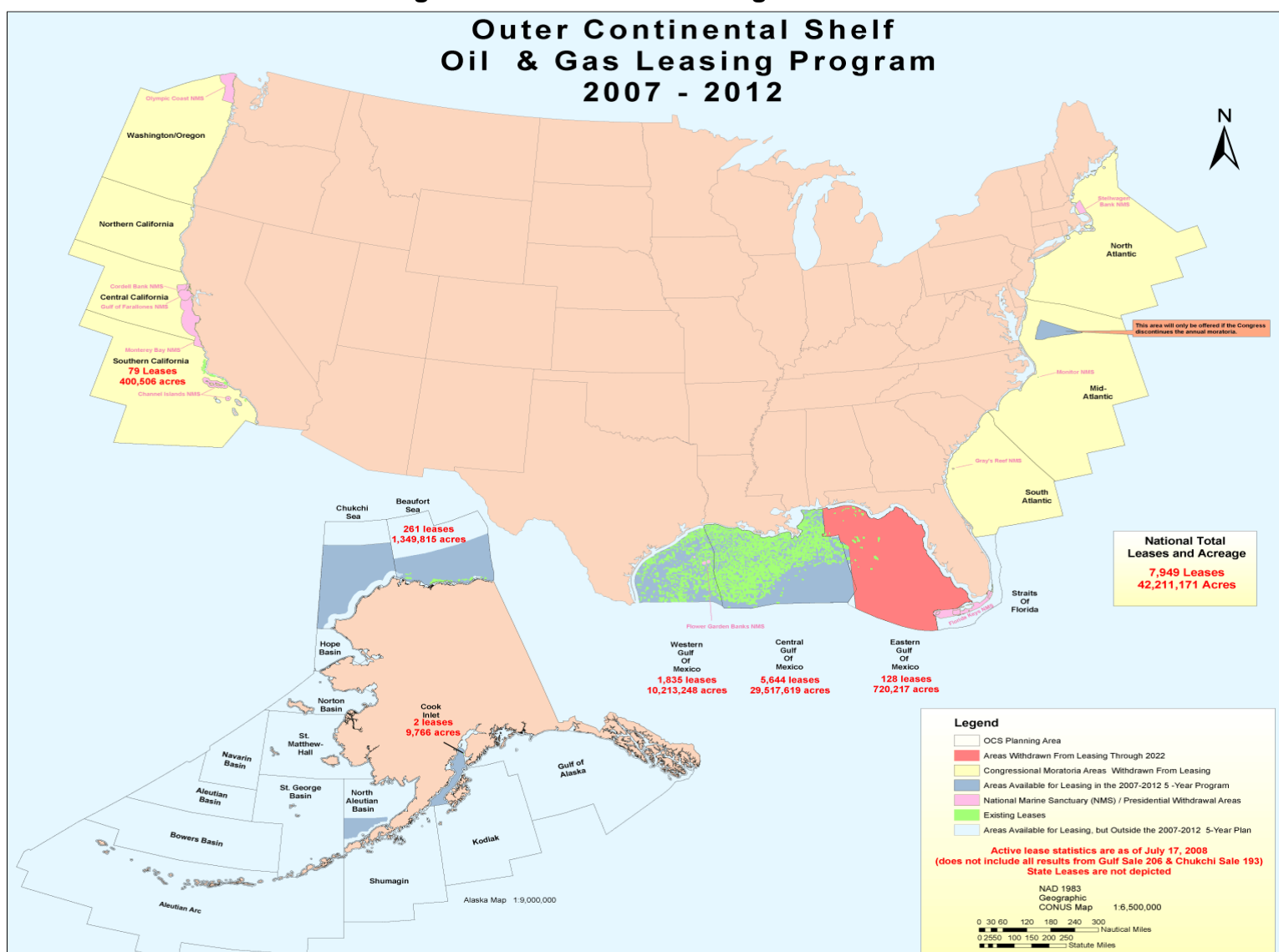
Figure 1. MMS Five-Year Program Areas

MMS defines the OCS as submerged lands, subsoil, and seabed between the seaward extent of states' jurisdiction and the seaward extent of federal jurisdiction.