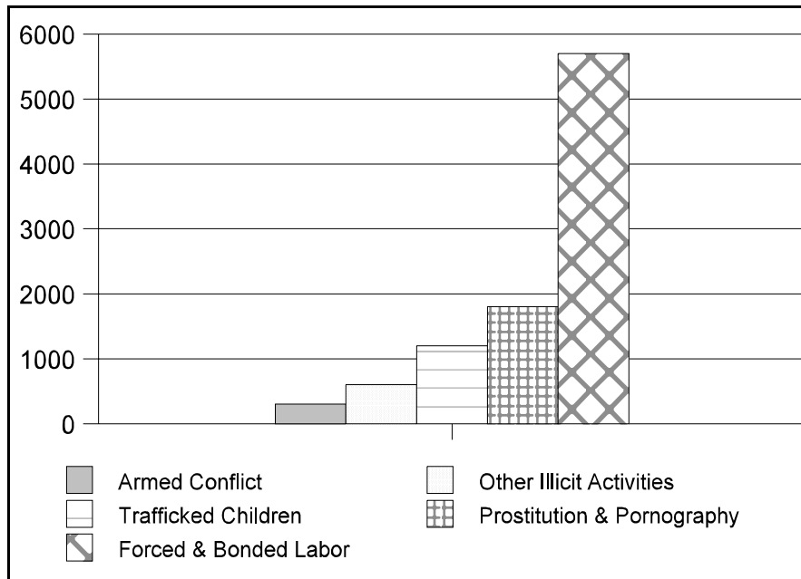
Figure 2. Children in the Worst Forms of Child Labor, 2000 (in thousands)